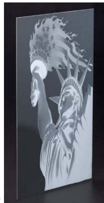
Simulated sand-blasted image formed on 4' x 8' glass sheet by printing digital image with "glass ink". Up to 400 dpi resolution is possible.

Additional examples and information on the process can be found at http://www.decotherm.net .