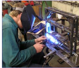
Purple Haze is assembled and tested by AU Destructors.