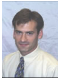
D. Scott Misture

Photocatalysts based on TiO_2 are currently in use or under development for applications with profound political, economical, and environmental impacts such as generating hydrogen from water and removing CO_2 from power plant operations will reduce the total greenhouse gas emissions. Instead of searching for methods for incremental improvements in the single oxide